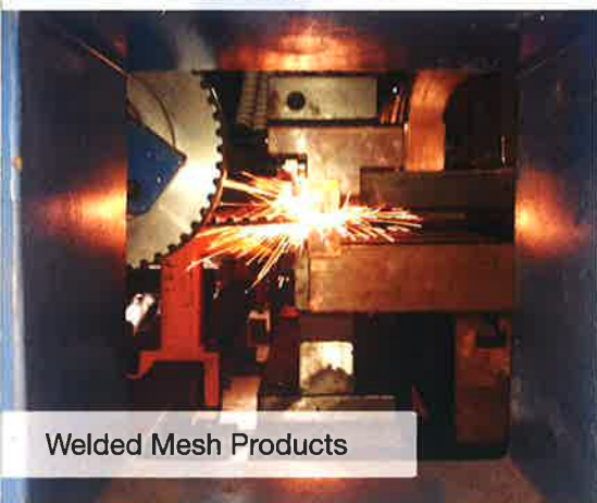
Welded Mesh Products

We had successfully supplied to various local Institutions such as JPS, TNB, KVMRT, DBKL, Local Universities, National Zoo and KTMB.