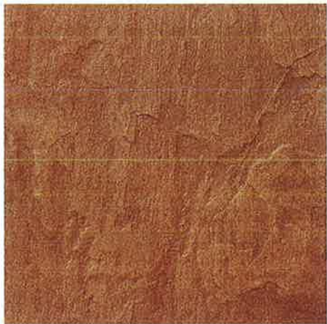
AYERS ROCK R28