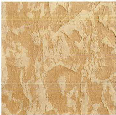
ST TROPEZ R25