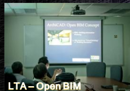
LTA - Open BIM