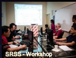
SRSS - Workshop