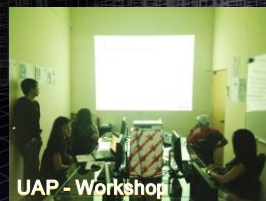
UAP - Workshop