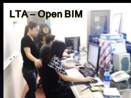
LTA - Open BIM