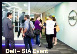
Dell - SIA Event