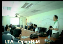
LTA - Open BIM