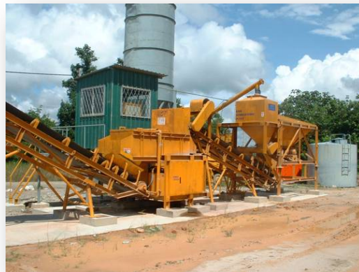
Photo. 1. In-situ Rehabilitation