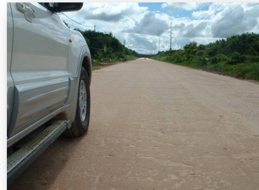
Photo. 2. Central Mixing Plant and Road Surface after Compaction