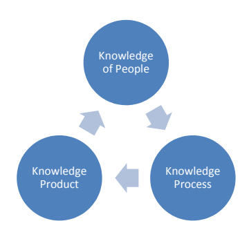
Figure 1: 3P of Knowledge (People, Process an Product)

In this proposed conceptual knowledge framework, the knowledge process will described an event where the know-hows of a person are externalized. Knowledge product is the output of externalizing the know-hows that can be located and manipulated as an object, which is possible to capture, distribute, and manage. Knowledge of people refers to the knowledge of competencies and profiles of its' employees in an organization. Elements based on the 3P of knowledge as the basis for competencies evaluation in an organization are also identified as in Figure 2.