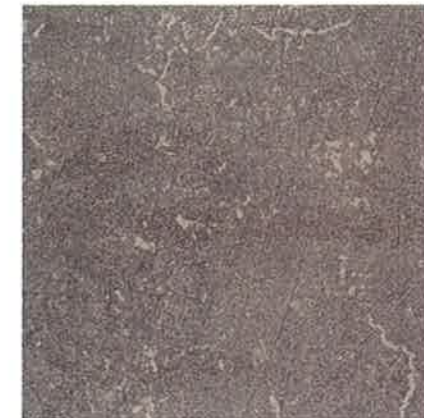
STORMY GREY N09