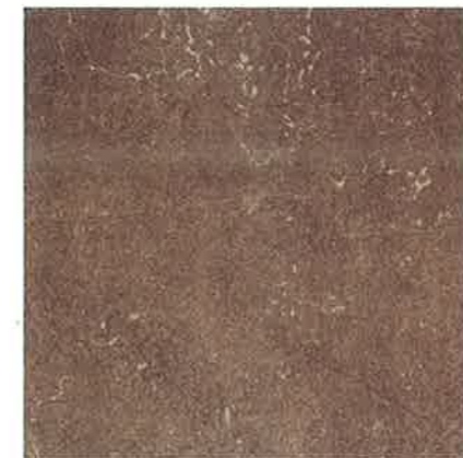
EARTHY BROWN N11