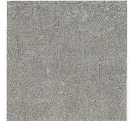
MISTY GREY N08