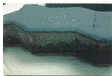
Silicone Paint System

Feltec Silicone Paint finished with appropriate coating system and conditions will resist to;