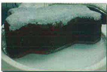
Normal External Acrylic

Feltec Silicone Paint also gives a paint film which is porous enough to allow water vapor to transmit and escape from the surface of wall. This minimizes paint failure caused by trapped moisture.