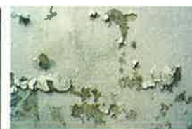
Blistering and Peeling