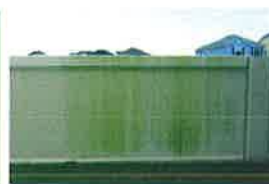
Fungus and Algae