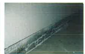
Damp Rising and Patchiness