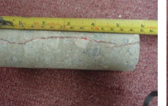
B07 (Cross Head)