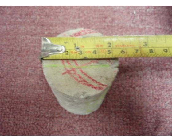
B10 (Cross Head)