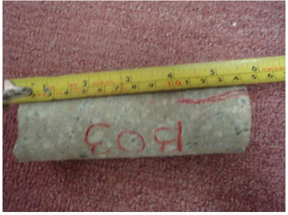
B03 (Cross Head)