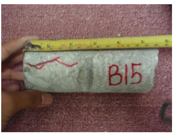
B15 (Cross Head)