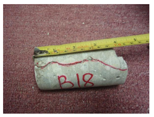
B18 (Cross Head)