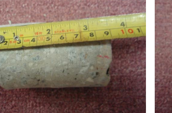
B05 (Cross Head)