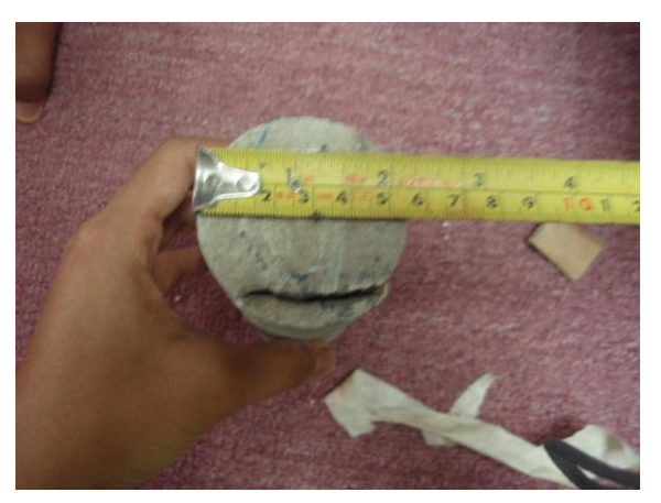
B17 (Cross Head)