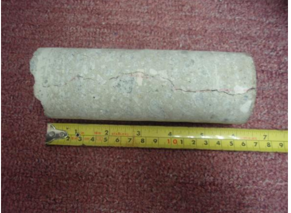
B08 (Cross Head)