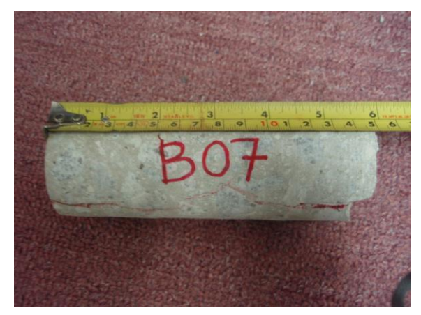
B07 (Cross Head)