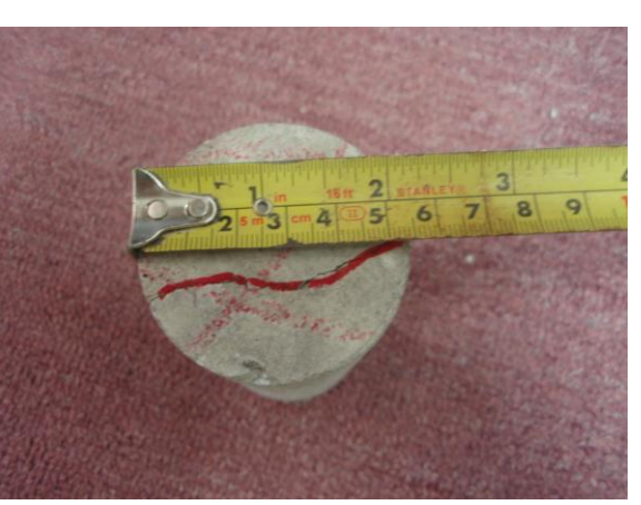
B07 (Cross Head)