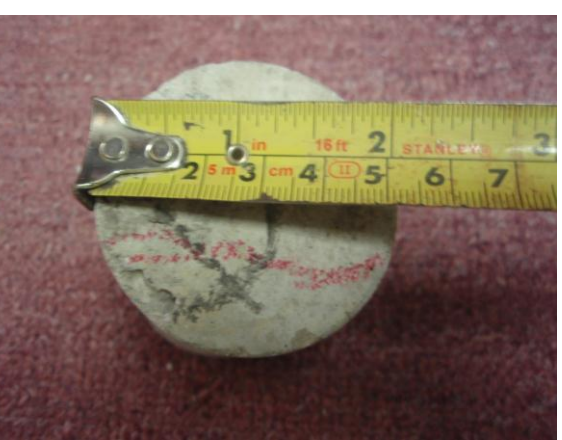
B05 (Cross Head)