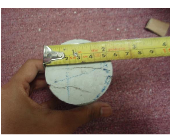
B18 (Cross Head)