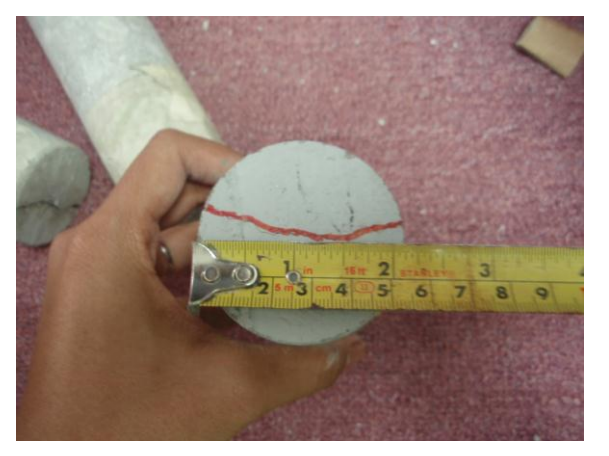
B14 (Cross Head)