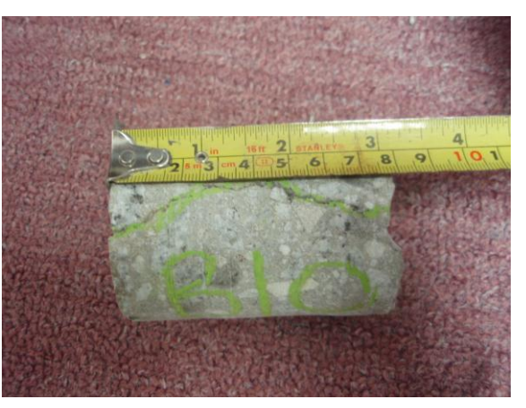
B10 (Cross Head)