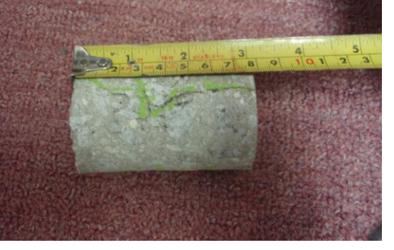
B10 (Cross Head)