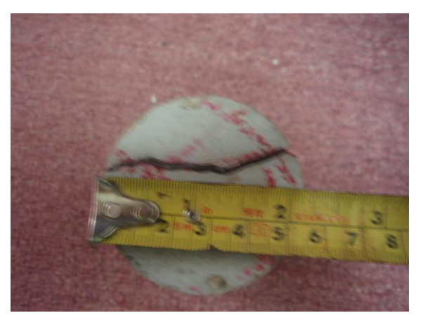
B01 (Cross Head)